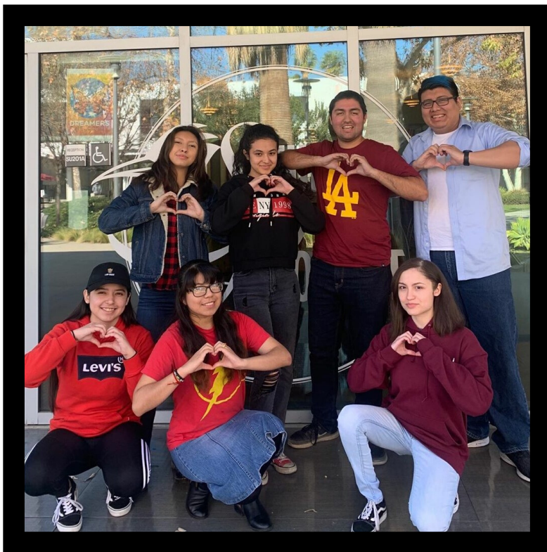
Faar coalition members on National wear red day; February 7, 2020